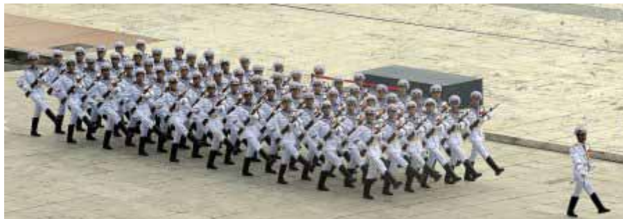
A Vietnamese Navy honor guard goose-steps during a “review” at the 2010 ASEAN conference

Got that, Manchin? Got that, Sinema? Unless you goose-step to the party narrative and get H.R. 1 or S. 1 to the Goofball’s desk in the Oval Office – and assuming someone is there directing him to the signature line – the Democrats will be, to use the colloquial vernacular term, “S.O.L.” Simply outta luck. Never mind that the filibuster might just be the mechanism that saves the Republic, Clyburn whines that he is “insulted” by Manchin’s resistance. Sharpton hisses that unless Manchin and Sinema toe the line, he will slander them as “supporting racism.” Democrat collegiality on full display.